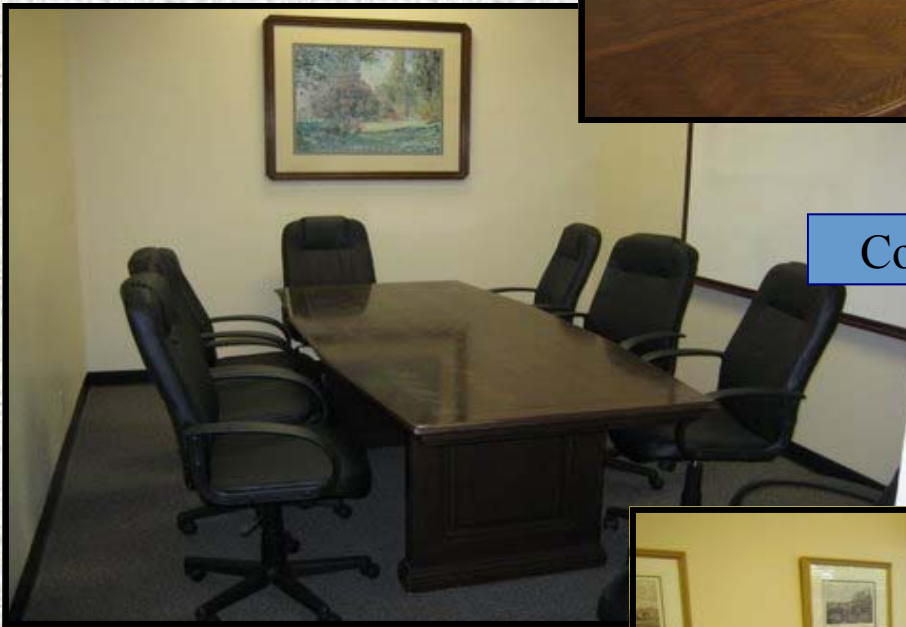
Common Conference Room